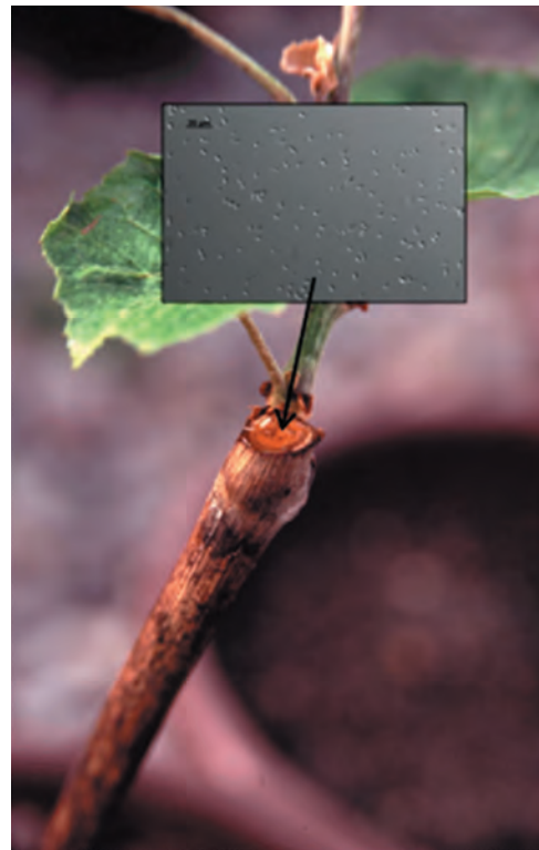
Fig. 1: Artificial infection of pruning wound with conidial suspension of Phaeoconiella chlamydospora .

Artificial infection: Appr. 7 d after outgrowth pruning was simulated by removing the uppermost portion of the shoot; the upper node was not affected. The resulting pruning wounds were inoculated with 40 µL of the above conidial suspension (Fig. 1). Control plants were treated with sterile water. For each cultivar, 40 plants were assigned for infection, 20 plants remained non-infected.